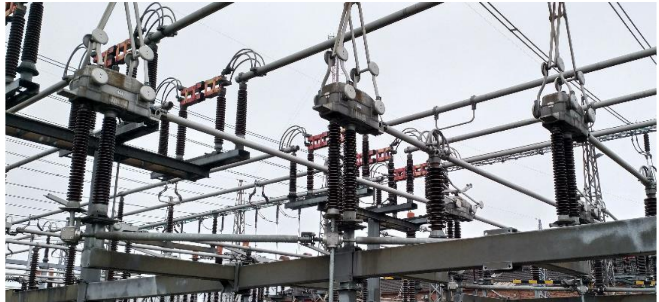
Temperature monitoring for connection joints at an electric switch station