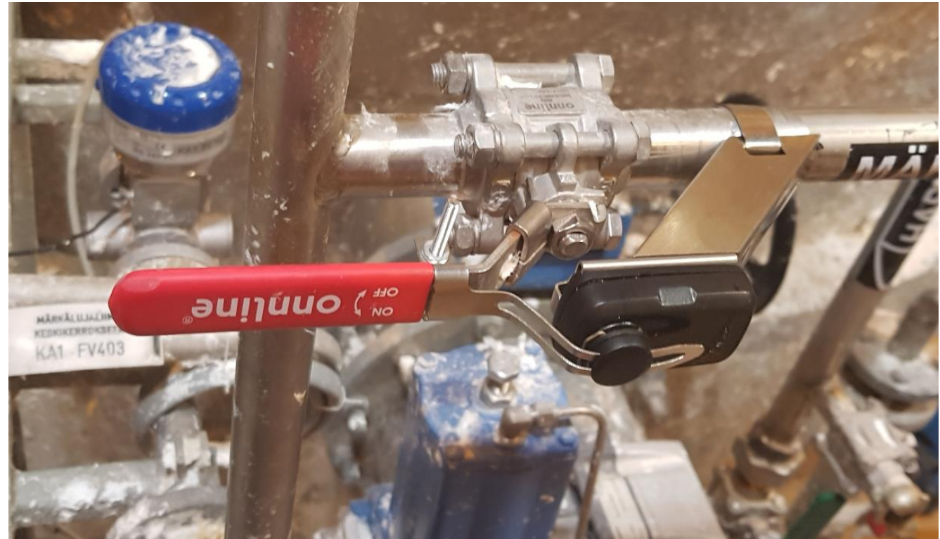
Valve monitoring in a pulp&paper plant

BETTER PRODUCTIVITY PREDICTIVE MAINTENANCE IMPROVED SAFETY